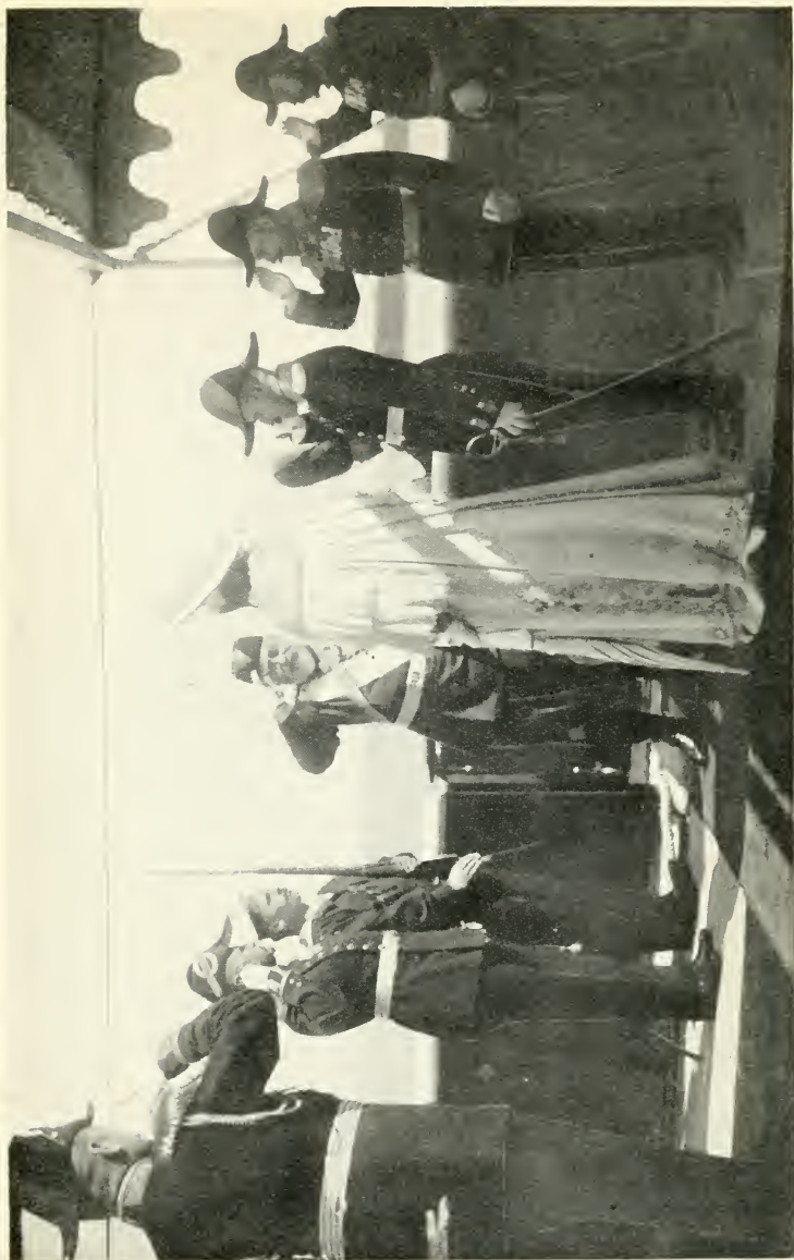
REVAL—1908. King Edward and the Empress Alexandra.